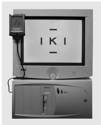
Figure 1: Electronic Visual Acuity Tester (EVA)